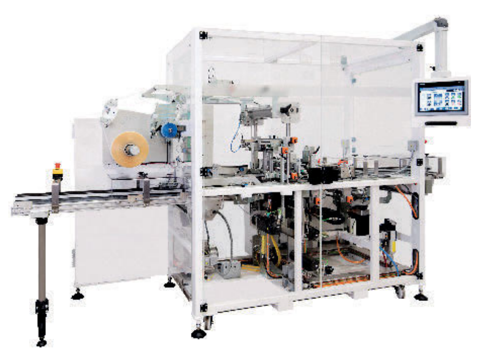
The TMX overwrapping machine is suitable for individual and bundle pack overwrapping

As a company heavily involved in the tobacco industry, it is important to stay on top of current rules and regulations and, rather than being a hindrance, changes such as the recent Track and Trace legislation have acted as a driving force for Marden Edwards. In fact, it has resulted in the growth of the company's Coding and Tracking division. "We are expanding our portfolio of products in line with the legislation demands of EUTPD and the WHO FCTC legislation. To date, we have supplied and installed our Marden Edwards Tracking System (METS), over 350 systems, into 18 countries covering 5 different legislations in 4 continents," confirms Gary. As Marden Edwards supplies its machines to companies across the globe, it is important to be aware of the individual legal requirements in each country. Each product that is